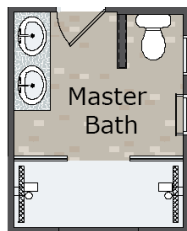
Master Bath Option #1